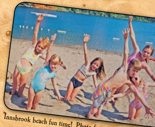
Innsbrook beach fun time!