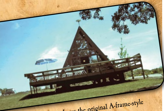
This photo shows the original A-frame-style golf pro shop.

Celebrating 40 Years of Community, Nature & Family