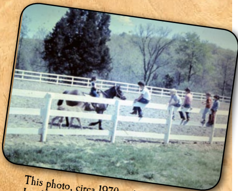
This photo, circa 1970s, shows the original Innsbrook cowboys down at the stables.