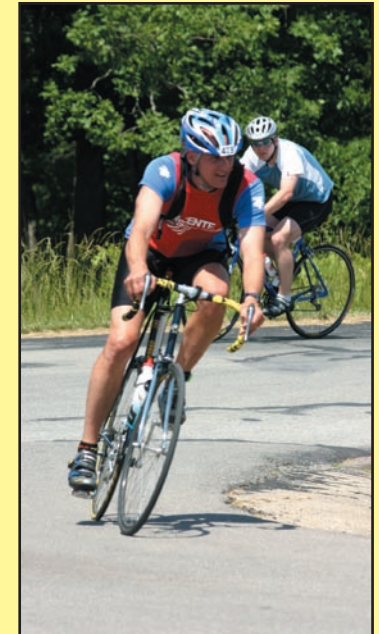
Athletes enjoy Innsbrook as a place to train for triathlons.