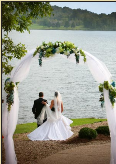
Celebrations come naturally at Innsbrook.

Accommodating groups from five to 200, Innsbrook Resort & Conference Center can personalize your get-togethers with catered barbecues, beach parties, and more! Our experienced planning staff can assist you with all the details, from menus and flowers, to live entertainment and overnight accommodations.