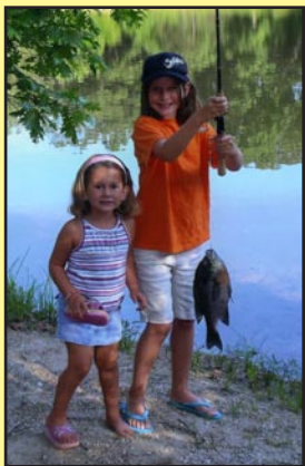
Nothing puts smiles on the kids' faces like a big catch!

Our condominiums rest on 150-acre Lake Aspen, so the lake is the center of vacation life at Innsbrook. Because we have a “no gas-powered motors” rule , our waters are safe so you don't have to worry when your kids are playing and you won't have to listen to noisy power boats.