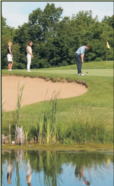
Our course ranks top in the St. Louis area.