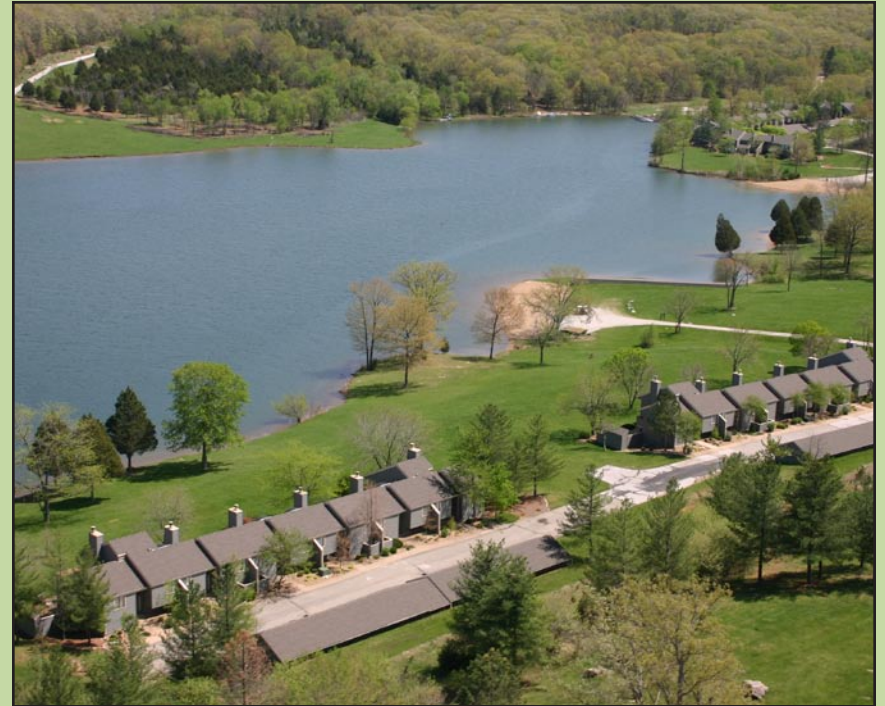
The condos at Innsbrook offer comfort and privacy, wonderful for couples and families. Each offering a fireplace, dining area and full kitchen, the condos have a wonderful home-away-from-home environment. Most offer lake or wooded views.

We also offer lessons, driving range, practice putting green and full-service pro shop.