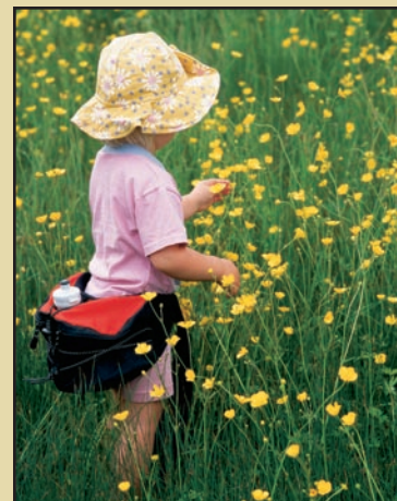
Get up close to nature at Innsbrook.