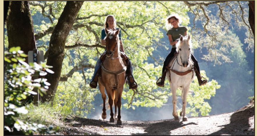
We offer a variety of trails for horseback riding, a great activity no matter the season.