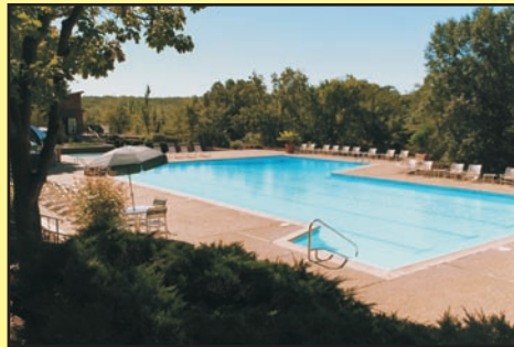
Our pool deck overlooks 150-acre Lake Aspen.