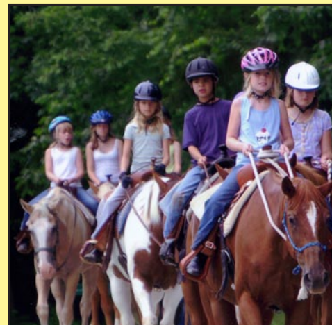
We offer trail rides for beginners and novice riders.