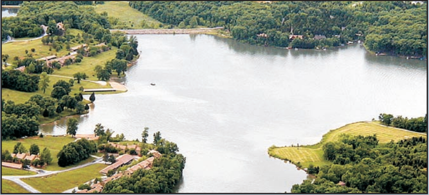
Our condominium complex sits on the shores of beautiful 150-acre Lake Aspen.