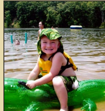
Our lakes are safe, clean and a fun place for the kids to splash around!