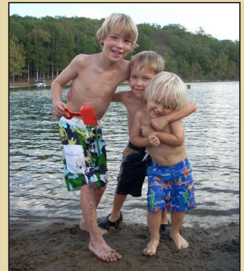
Our sand beaches are "the place" to be in the summer.