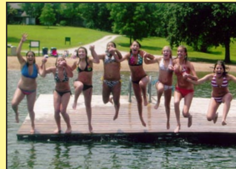
Create some of your favorite memories at Innsbrook.