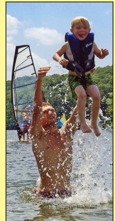
Family time is #1 at Innsbrook.