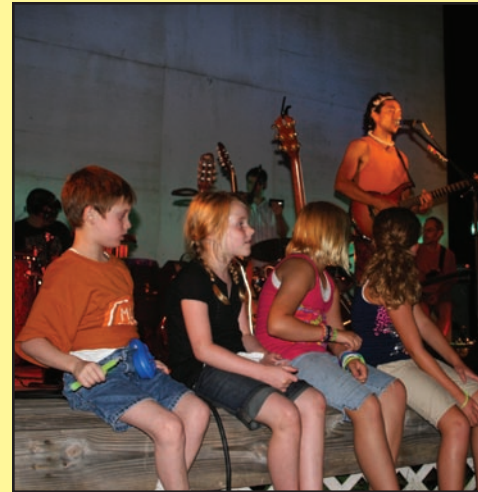
Our Summer Breeze Concerts feature some of the area's best musicians in a setting that you can't get anywhere else!

What's there to do around Innsbrook? Take a drive to Augusta or Hermann to enjoy wine country. Enjoy a day trip to Historic St. Charles to explore its restaurants and shops. Or how about Hannibal to discover the history of Mark Twain. Just a few minutes away are pumpkin and Christmas tree farms, antique shops and orchards.