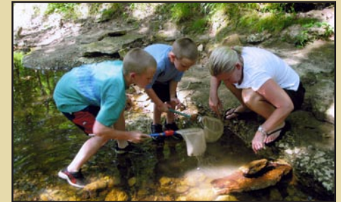
Our nature trails feature worn paths and interesting creeks perfect for exploring!