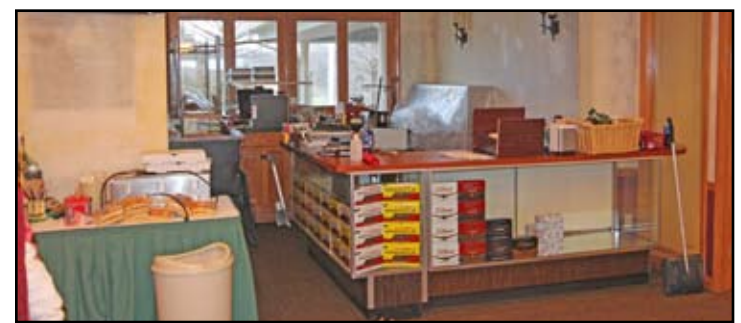
Pardon our mess! The temporary Pro Shop is set up in the dining area of the Clubhouse restaurant.

As renovations and improvements continue in the Clubhouse, the Pro Shop has been temporarily relocated to the dining area of the restaurant (across the hall from its previous location). This spring, the Pro Shop will move to a new permanent location in the lower level of the Clubhouse. There will be a new outdoor entrance for golfers and Pro Shop customers to ease traffic flow in the area and allow the main floor of the Clubhouse to be completely dedicated to the new restaurant. By making the move to a new Pro Shop, we will be able to expand the selection of Innsbrook-logoed merchandise offered there. In 2015 we will also continue to make improvements to the golf course in an effort to provide the highest quality experience to golfers of all levels and abilities. Throughout all of these renovations, the golf course will remain open for business, weather permitting. Ext. 203.