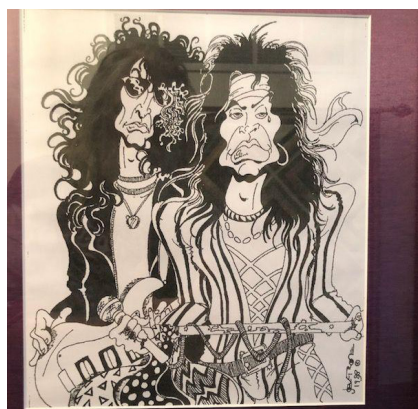
Created by Joe Vetrone